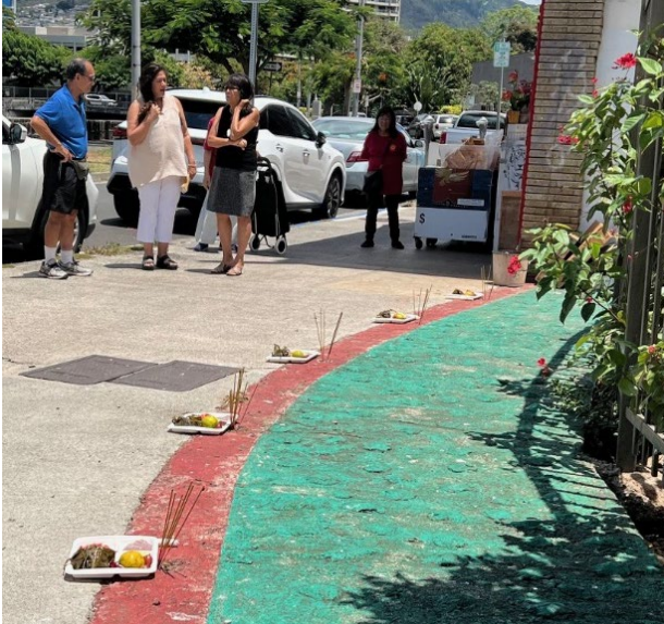
Outside Lum Sai Ho Tong plates of food are placed for the hungry ghosts. We prepared Hawaiian food to honor all the Hawaiian people who lived here for centuries.

On the seventh month of the Chinese lunar calendar the gates to the underworld open up and the spirits of the deceased are free to mingle with the living. According to belief, the spirits are hungry so on the 15 th day of seventh month Chinese communities throughout the world hold a festival to appease the wandering ghosts. This festival is called Chung Yun, or Hungry Ghost Festival. As with tradition, Lum Sai Ho Tong held a celebration in which prayers were given, plates of food prepared and paper money金銀紙 (gam ngan) burned.