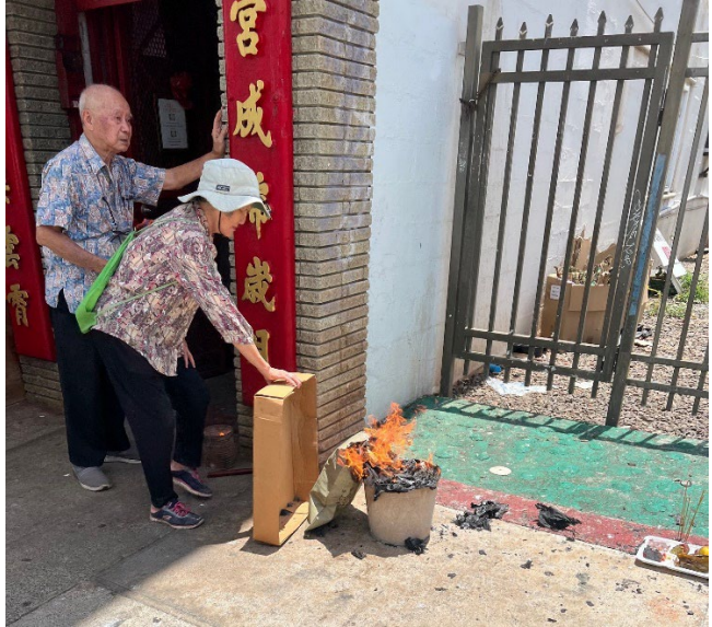
Faux paper money is also burned as offering for the wandering ghosts.

Many cultures throughout the world share the same belief that each year the dead visit the living and do similar festivals (ie. Dia de los Muertos Day of the Dead in Mexico, Obon in Japan).