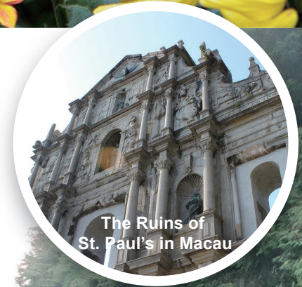
The Ruins of St. Paul's in Macau