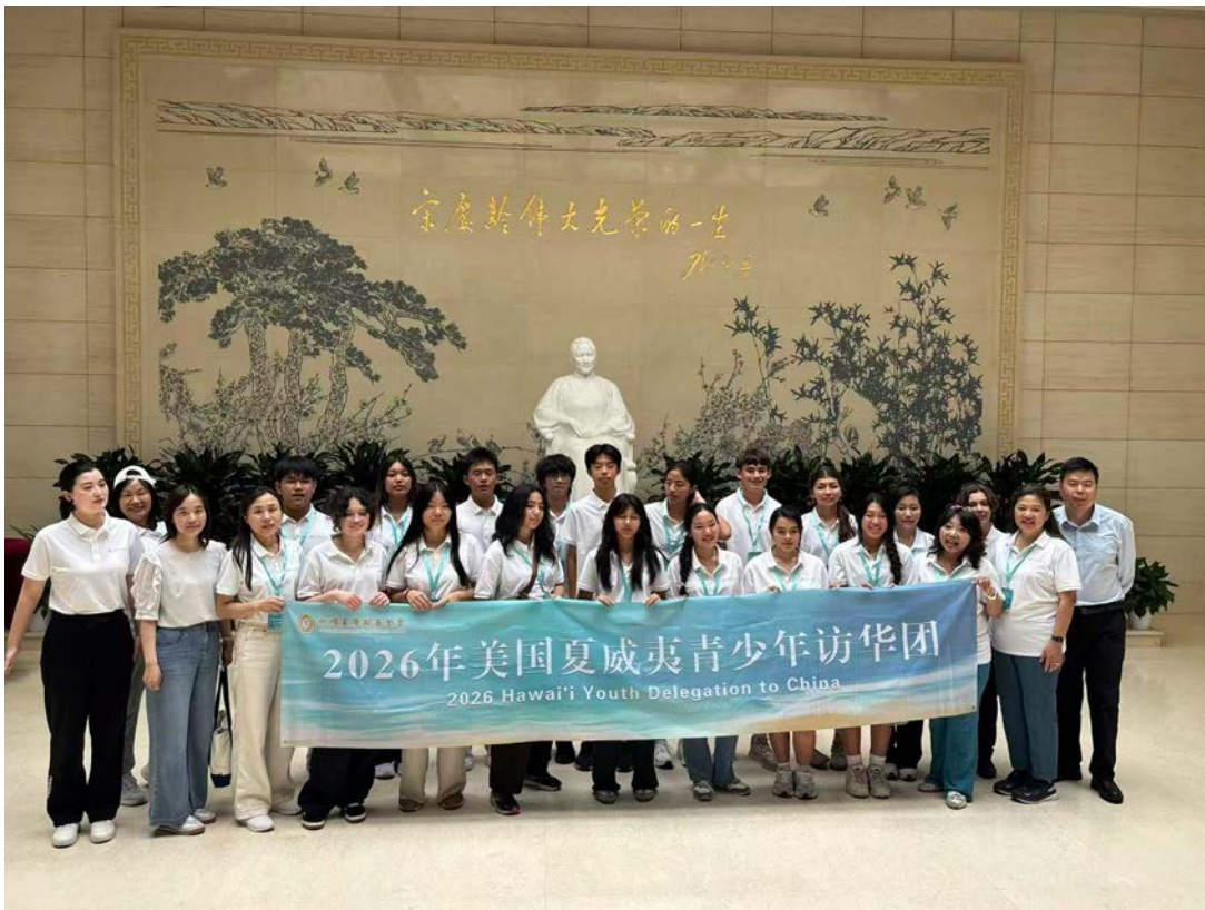
Photo: Hawaii students and teachers visiting Mdm Sun's (Soong Ching Ling) former residence.